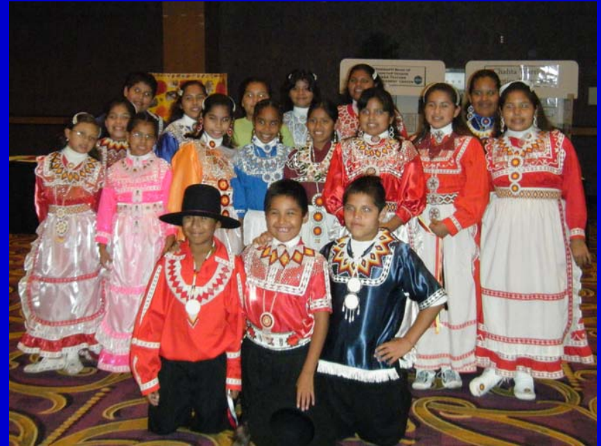
Mississippi Band of Choctaw Indians